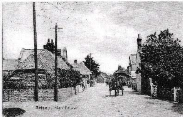
High Street, Selsey