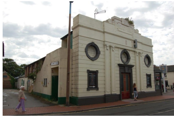
Positive building in High Street