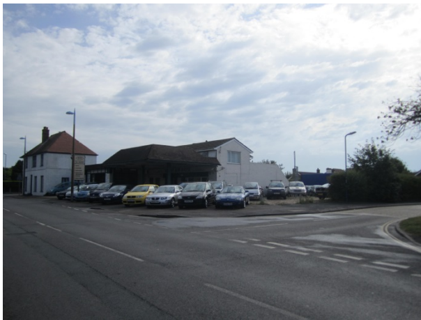
Junction of Wellington Gardens and High Street

The northern section of the conservation area retains the largest number of historic buildings, usually set back from the road with attractive gardens, although there is one very prominent terrace on the west side which sits on the back of the pavement. Most of the gardens are small, although the occasional garden is more spacious, such as the garden behind no. 20 High Street. Fortunately this limitation in size means that there is no real likelihood of backland development. Some buildings, such as no. 21, sit right onto the back of the pavement, creating pinch-points.