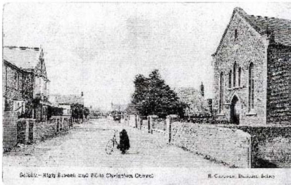
Selsey High Street and Bible Christian Chapel