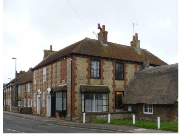
Nos 24-28 High Street