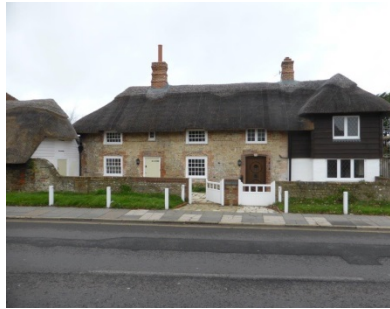
Restored Sessions House