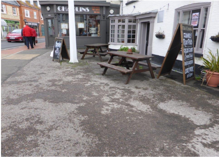
The Crown, High Street