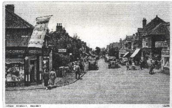
High Street, Selsey