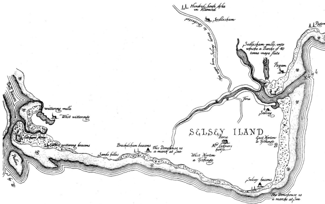
1587 Map of Selsey (Armada Map)