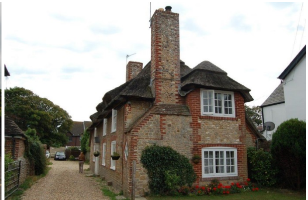
No 113 High Street