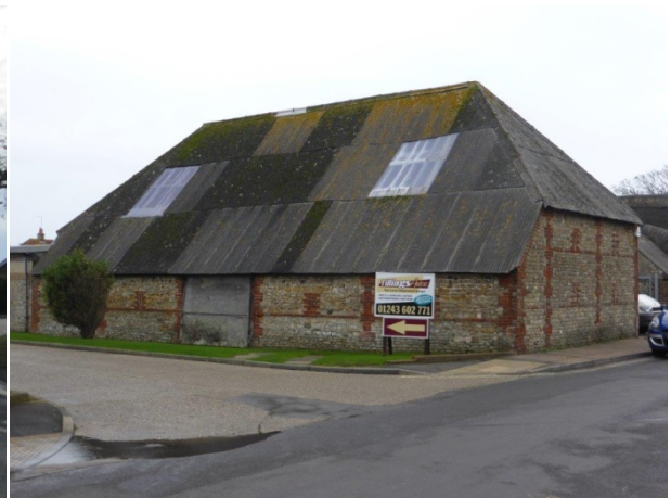
Barn at the back of builders merchants