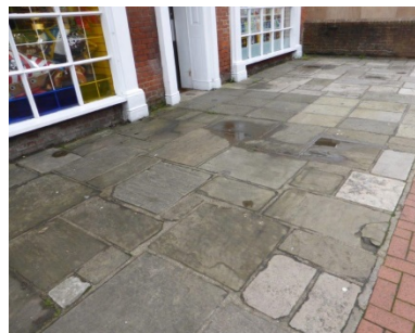
York stone paving