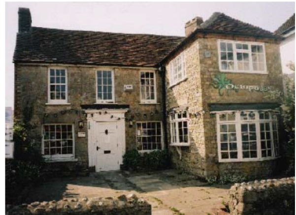
No 102 High Street