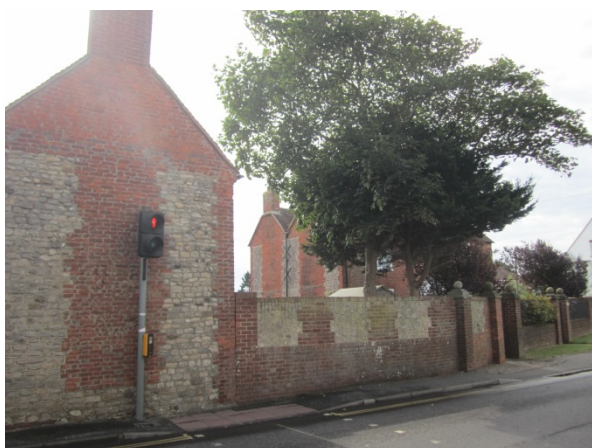
Ivy Lodge, No 65 High Street