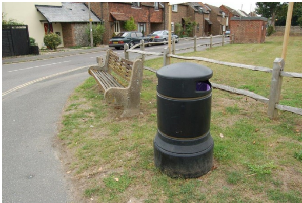
Seating area by Churchyard

Applications for changes to all any of the “Positive” buildings in the conservation area, as identified on the Townscape Appraisal map, will be assessed in the light of the Good Practice Guidance enclosed at Appendix 3. Proposals for demolition will be resisted unless there is clear and convincing evidence of public benefits to outweigh the harm of their loss.