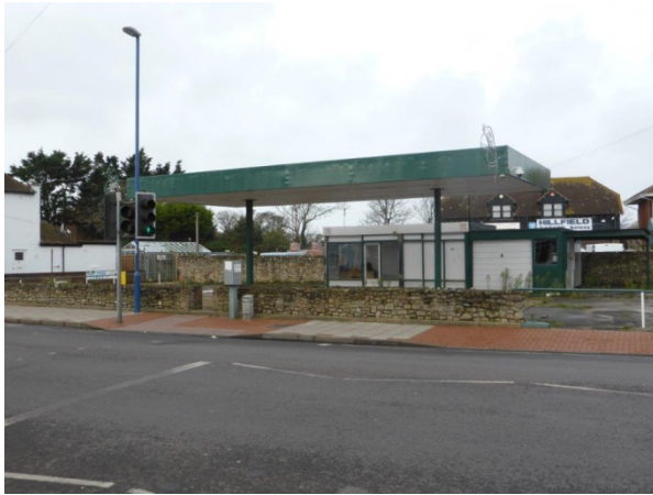
Storage Depot and Yard at 94-96 High Street