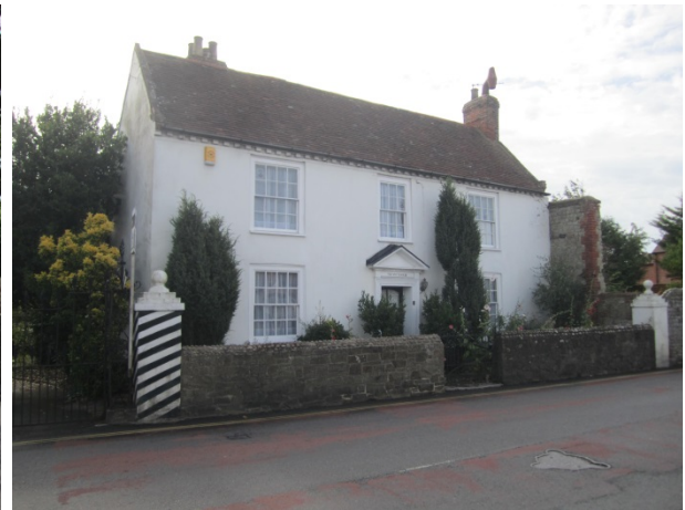
The Whyte House