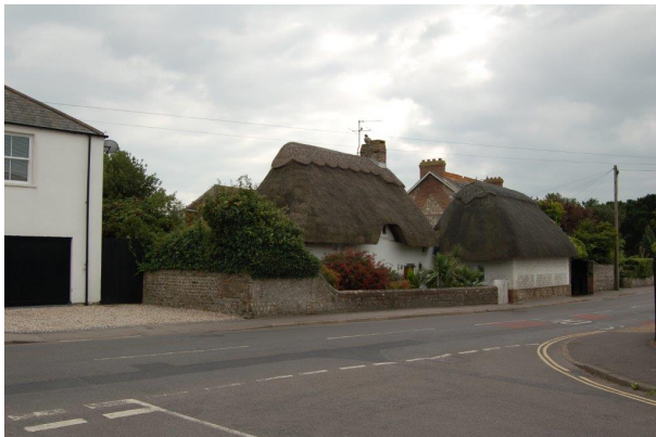
No 21 High Street on left