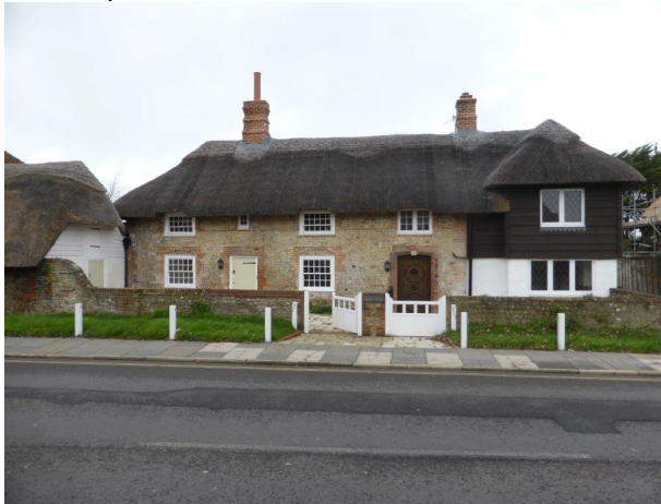
Sessions House, following restoration