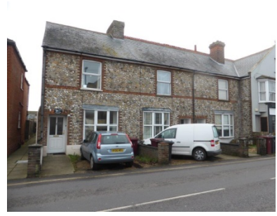
Beach flint walls