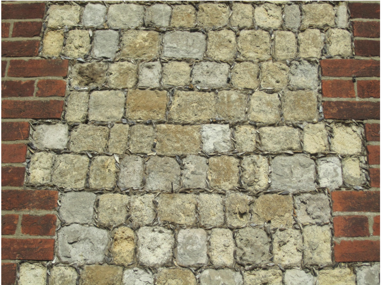
Mixen stone with flint galletting