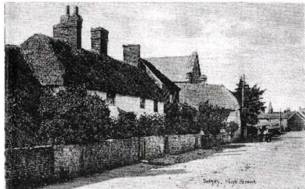
High Street, Selsey