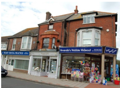
Variety of Shops