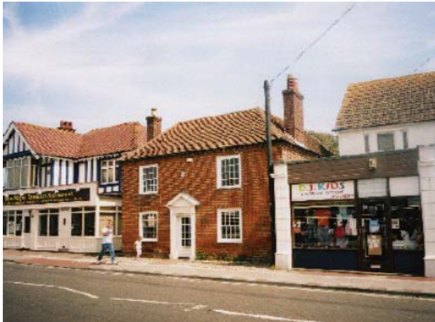
No 87 High Street

windows and a Georgian-style doorcase, all modern. In front, a small 19 th century extension has been added, also in stone, with modern casements windows and small curved bay to the ground floor. A steeply pitched clay tiled roof add interest with a hip over the front extension.