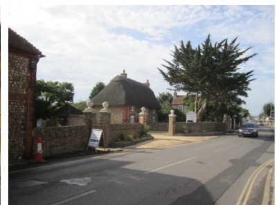
Wall next to The Whyte Triangle outside St Peter's The High Street curves gently