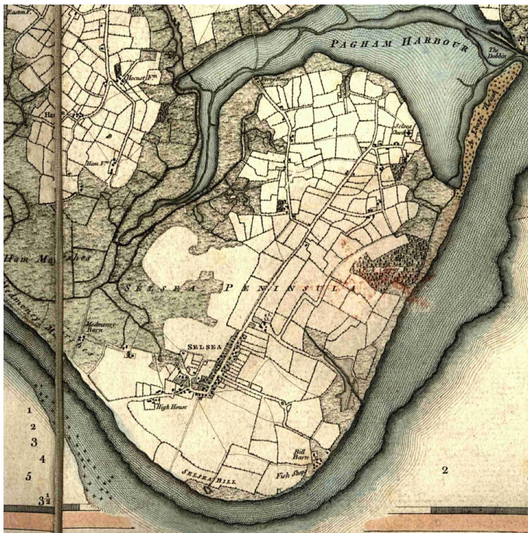
Map 1778 Yeakell and Gardiner