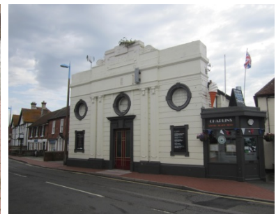
Former Selsey Hall