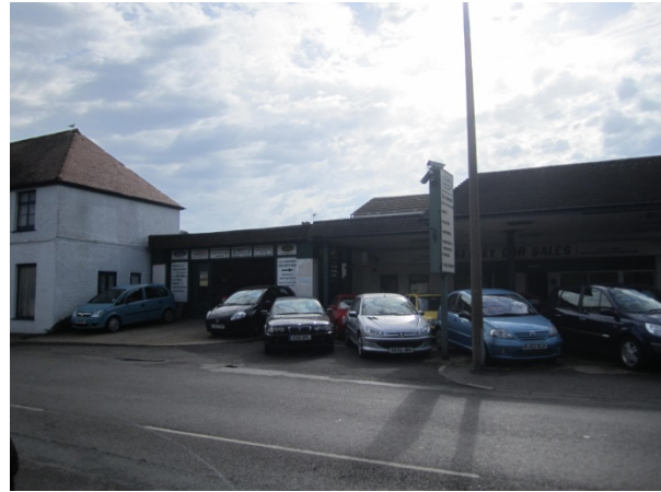
Selsey car Sales, 17-19 High Street