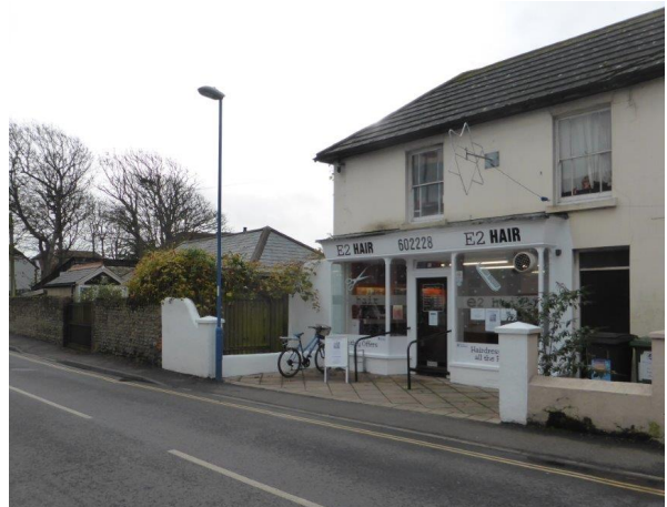
No 2 East Street