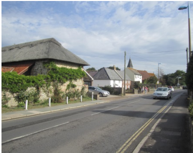
View northwards to Church Spire