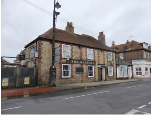
The Neptune Public House