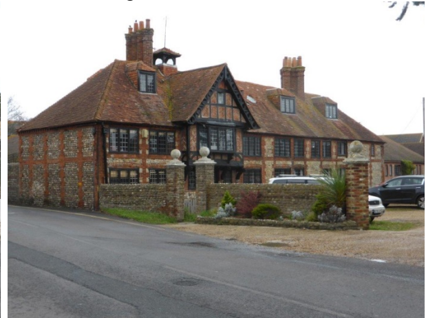
The Old Malthouse